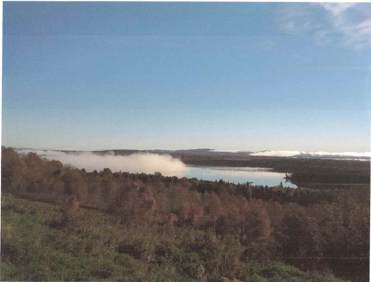
Smoke on the Water